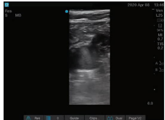
Figure 2. Another short-axis view of the femoral vein (center) and the femoral artery (bottom right) at the site of the saphenous vein inflow (top right). Swirling pattern of high echogenicity suggests low-flow state.

The characteristic laboratory findings of CAC (ie, dramatically elevated levels of D-dimer and fibrin degradation products) indicate a highly thrombotic state with high fibrin turnover. How-