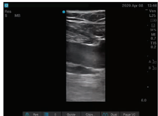
Figure 3. Long-axis view of the femoral vein, with spontaneous echogenicity and slow flow.

ever, other markers of disseminated intravascular coagulation remain relatively unchanged. 7 The prothrombin time and activated partial thromboplastin time are only mildly prolonged, if at all, and platelet counts are usually normal or only mildly low ( 100\text{--}150 \times 10^9/\text{L} ). 8–10